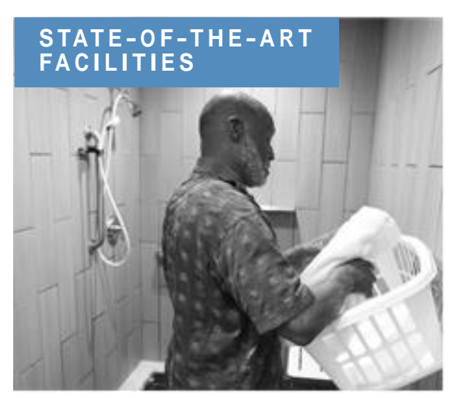
Recent renovations allow our guests to enjoy a private shower or hot shave in a clean and welcoming environment. Should they choose to do laundry, they are offered a new pair of underwear and a fresh set of clothing while they wait for their belongings to be washed and dried.