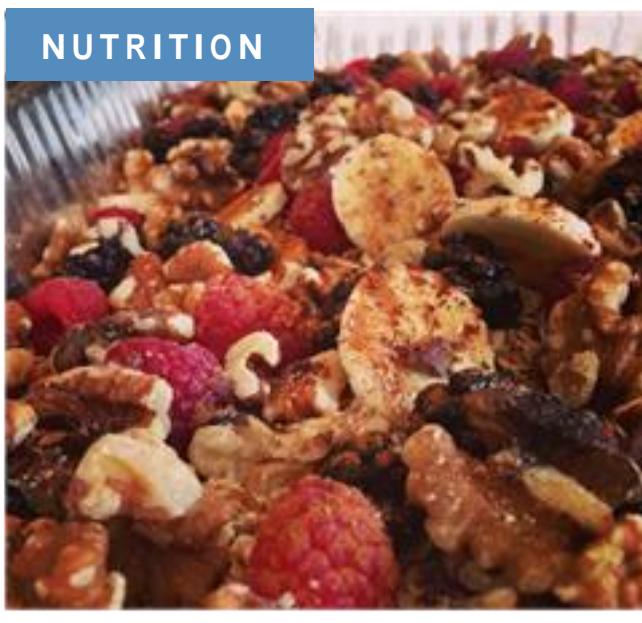
Upon arrival, guests are served a continental breakfast which often includes oatmeal, hard boiled eggs, fresh fruit and coffee. This is followed by a hot and nutritious meal at 9 a.m.